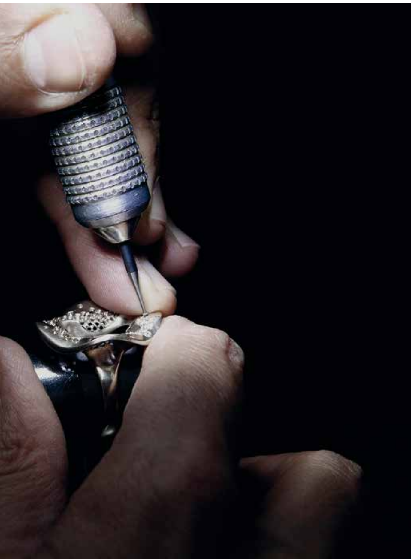
Anniversary100 production