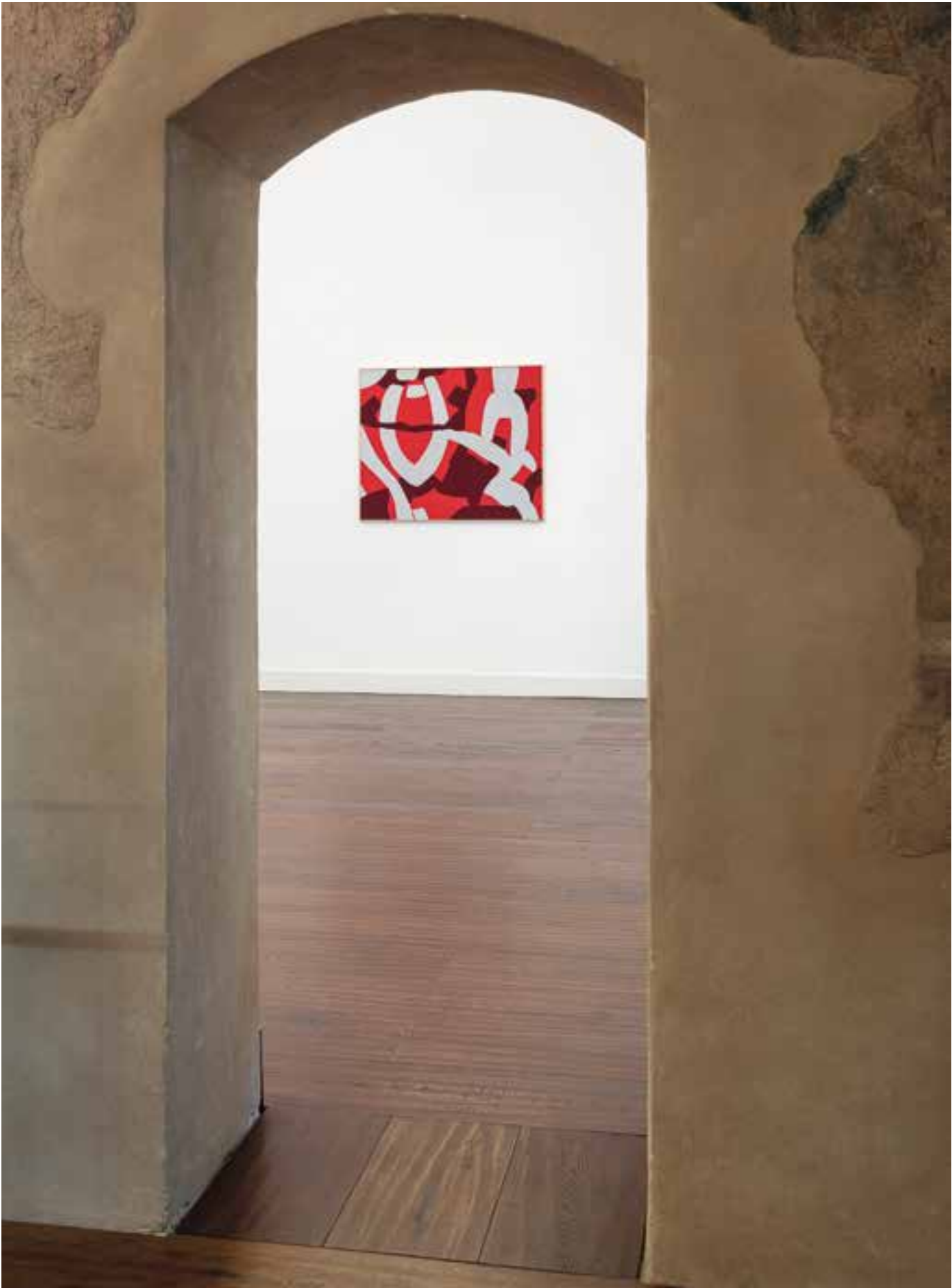
Carla Accardi installation (Galleria Massimo Minini)