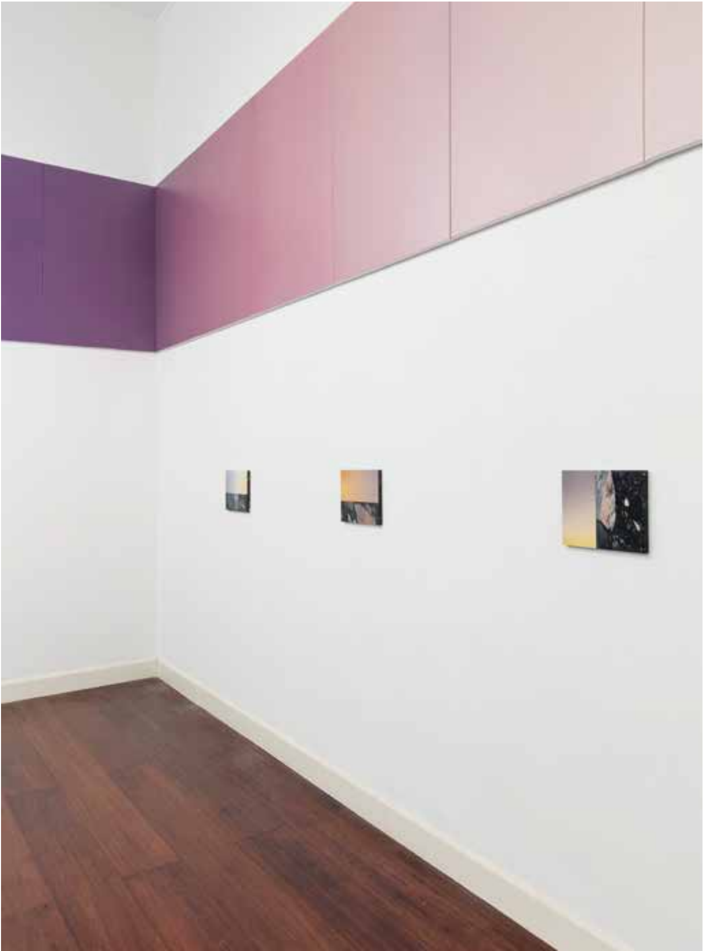
Loris Cecchini installation (Galleria P420)