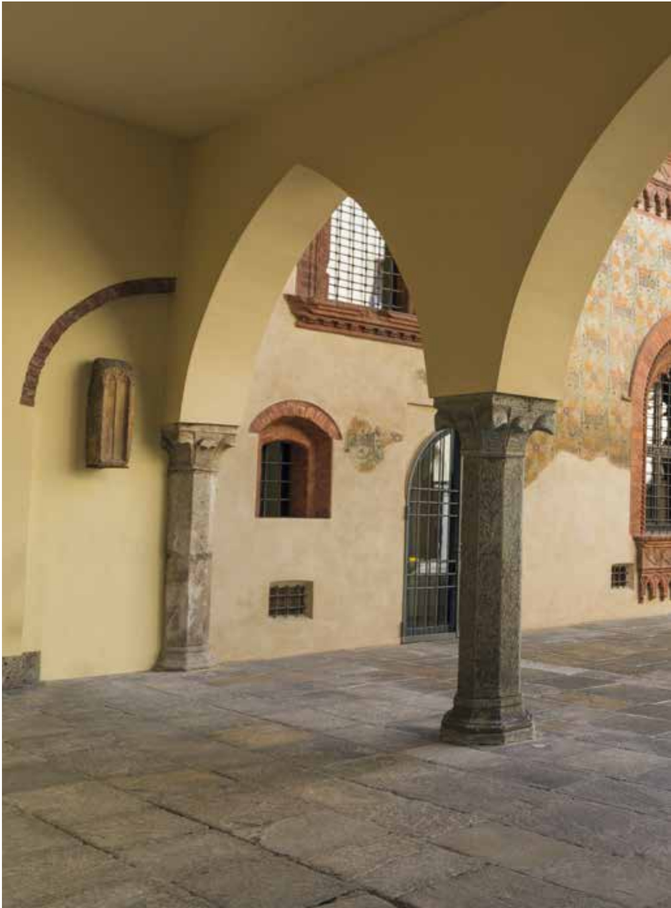
Antonini Milano showroom