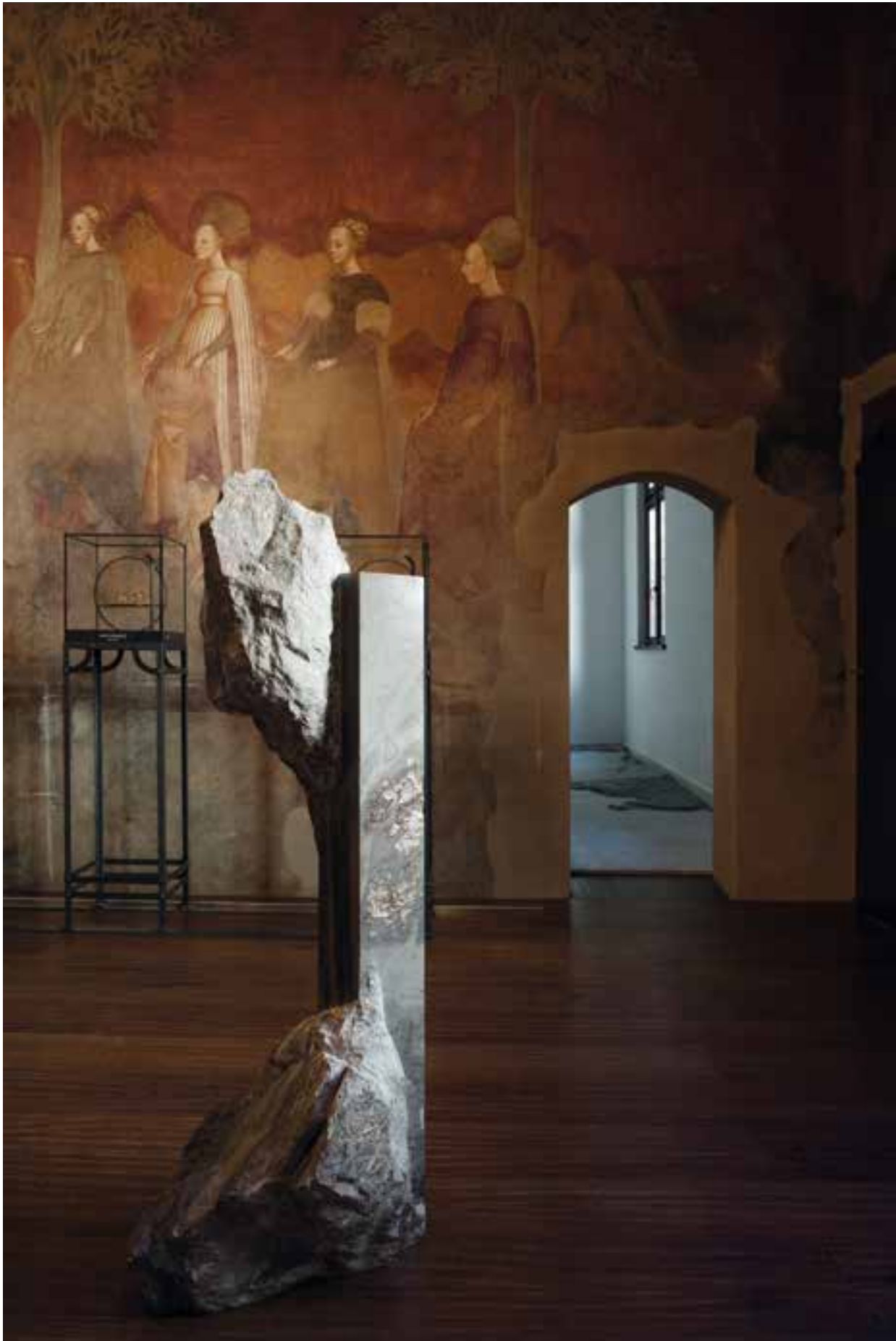
Mattia Bosco installation (Galleria Fumagalli)