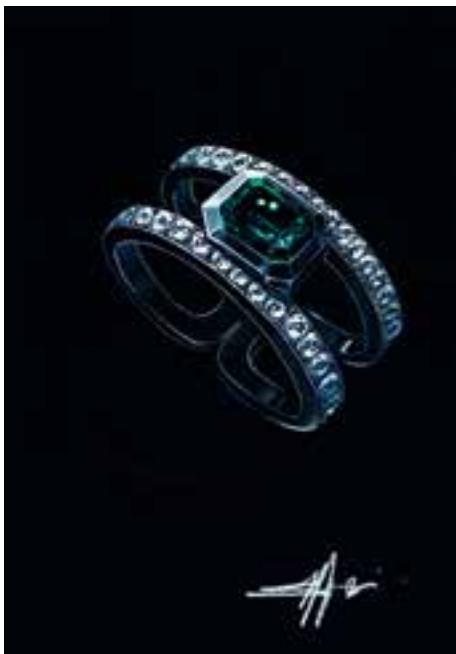
Draw of a ring in the 70's, from archives

Antonini was founded in Milan in 1919, a prestige diamonds and precious stones business. Their creations were immediate “must haves” for the sophisticated Milanese and Italian aristocracy. In time the company grew into a historic brand of fine jewellery. The Antonini collections show the research and passion for innovative design that set their jewellery apart. All the jewels are made entirely by hand in Italy’s fashion and design capital: Milan.