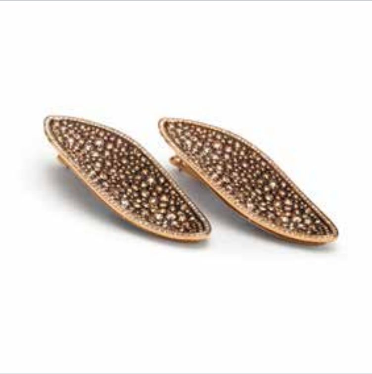
Limited edition collection